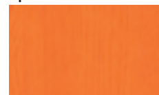
Opz. C07 arancio C