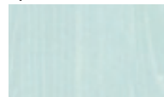
Opz. B06 celeste B