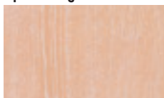
Opz. B05 salmone B