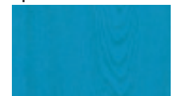
Opz. C08 azzurro C