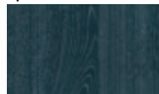
Opz. B10 antracite B