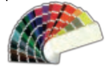
Opz. 999 colore campione